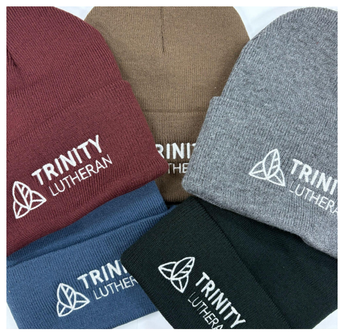
Interested in Trinity Swag??

11:05 - 11:25 Grades 5-8 11:30 - 12:00 Grades K-4 Contact Mrs. White or the school office if you can help out.