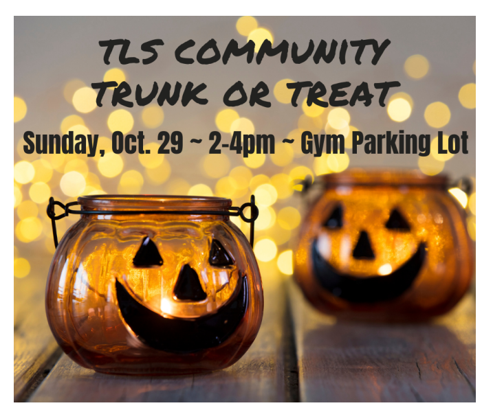
Get your costumes ready! Invite your friends and neighbors! Sign up HERE to decorate your trunk and be a part of the fun!

Miss Groeling and Miss Ogilivie are requesting some items you may have at your home and are willing to donate. The items can be old and even in poor condition and they will still take them. They are looking for: pool noodles, pvc pipe, cardboard, paper towel tubes, duck tape, dominoes or jenga blocks. All items can be brought to the STEM tub in the foyer by the school office.