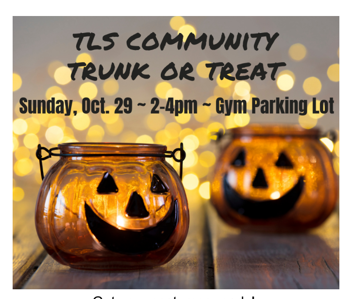
Get your costumes ready! Invite your friends and neighbors! Sign up HERE to decorate your trunk and be a part of the fun!