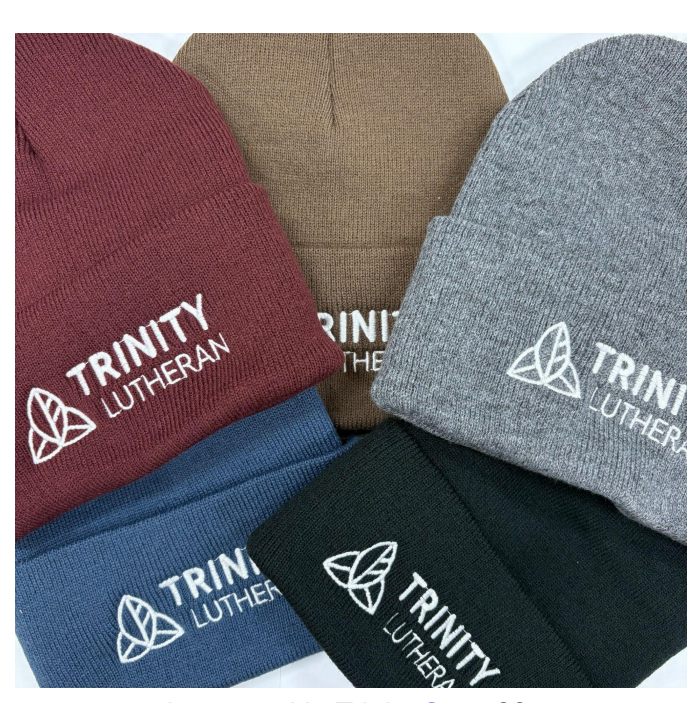
Interested in Trinity <a>Swaq</a>??